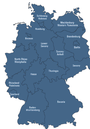
Model Building Code