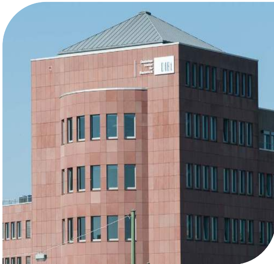
Deutsches Institut für Bautechnik (DIBt)