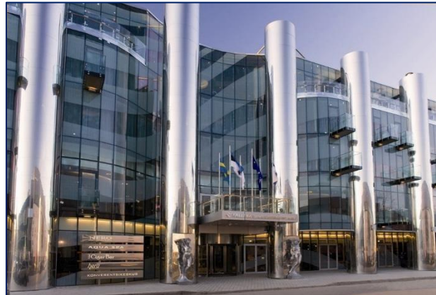
Figure 1. Picture of the facade of the Tallink Spa & Conference Hotel.

The Mid-Term Conference venue will be the Tallink Spa & Conference Hotel (Sadama 11a—Tallinn, Figure 1) , which is located near the Tallinn Harbour and within walking distance of the beautiful old town. The meeting will be held in the hotel conference center on the second floor .