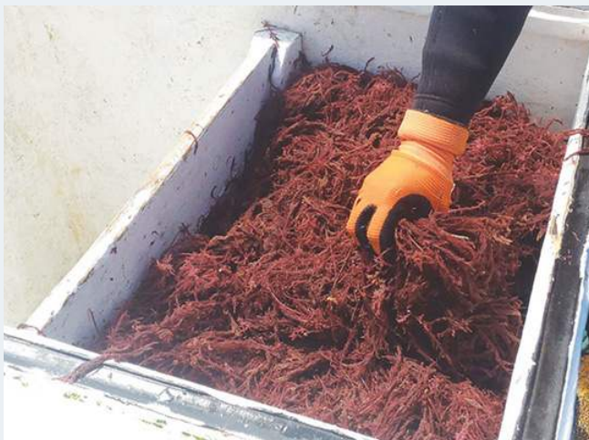
Picture 2. Asparagopsis taxiformis harvested for further treatment.

Clarias or African catfish ( Clarias sp.) is a group of species native to freshwater habitats throughout Africa