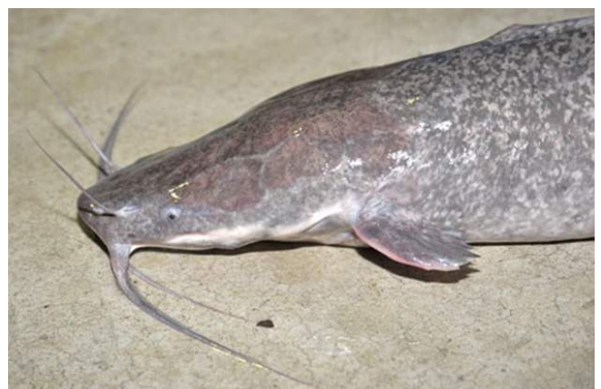
Picture 3. African sharptooth catfish Clarias gariepinus .

The aquaculture of Clarias catfish is relatively