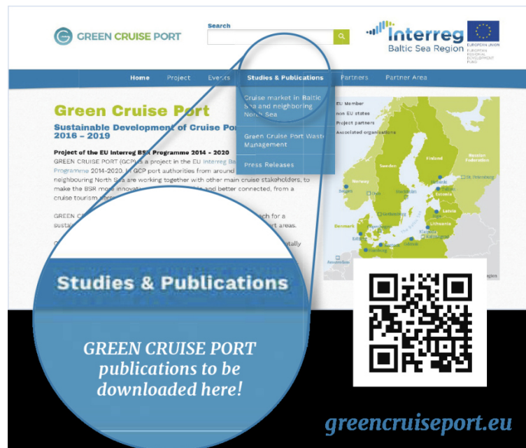
Figure 4: The GCP website “Source of Information”