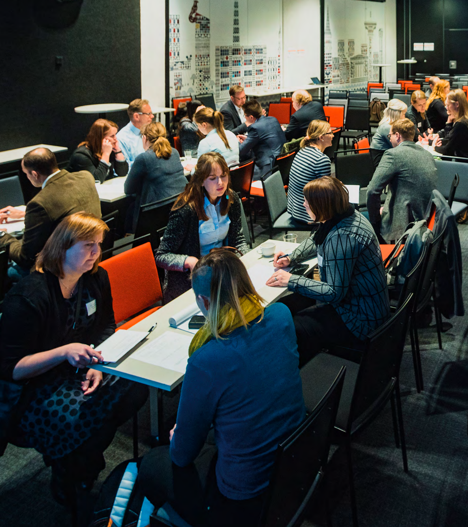
Photo: Interaction between circular economy stakeholders was promoted in BSR Stars S3 project also by organizing matchmaking events that focused on challenge-based discussion between public, research and private actors / Joonas Tähtinen